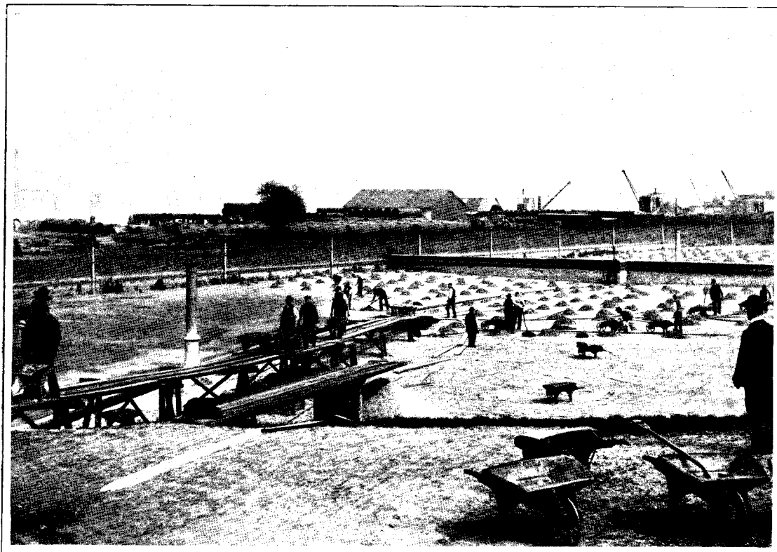
CLEANING OUT FILTER-BEDS, BATTERSEA (LAMBETH WATERWORKS)

Only 629 houses were on the first list of the supply, and no dividend was paid for twenty years, but the concern was controlled by far-seeing men who had no doubt of their ultimate success. In 1802 the area was extended to the "respectable and populous neighbourhood" of The Horns, Kennington. About 1810 the development of drainage led to a large increase of population in the Company's district, and the works had to be enlarged. By 1820 the wooden pipes were superseded by cast-iron ones. An open reservoir was erected on Streatham Hill in 1832, being served from the Belvedere Road Works, and two years later two large open reservoirs were